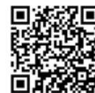
Swing Dance for KOVAR Event Page